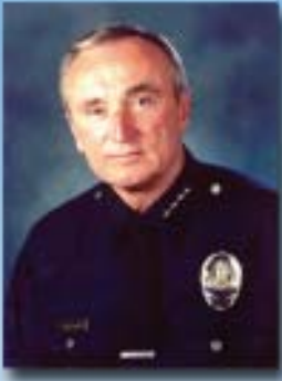
WILLIAM J. BRATTON CHIEF OF POLICE