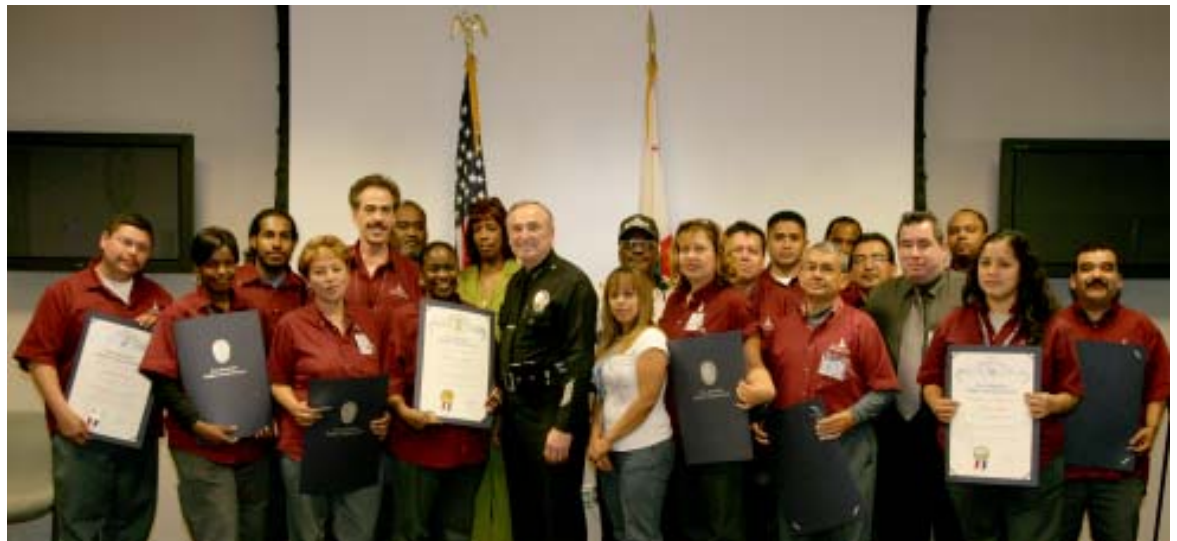
Chief Bratton, center, with Parker Center custodial staff.

“On behalf of the Department, I’d like to extend our sincere appreciation,” said the Chief, addressing the group. “It’s an old building, but it doesn’t seem old because of what you do. I enjoy seeing that you take pride in your work.” □