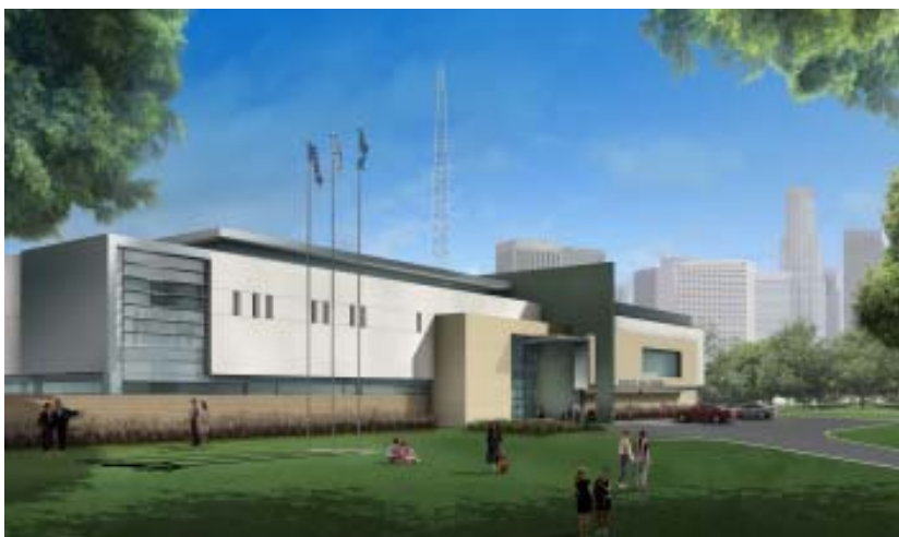
Artist rendering of the Rampart Area replacement station.