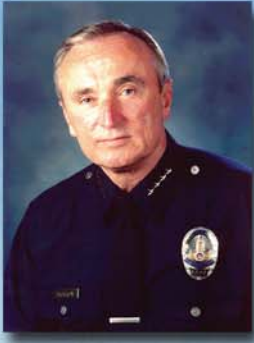
WILLIAM J. BRATTON CHIEF OF POLICE