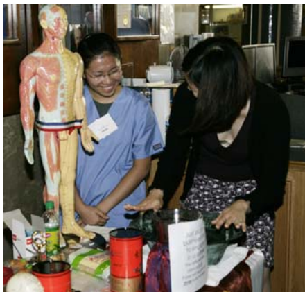
LAPD Health Fair

Organizations featured included American Diabetes Association, American Cancer Society, and Asthma & Allergy Foundation of Los Angeles. □