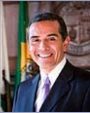
Antonio R. Villaraigosa Mayor City of Los Angeles