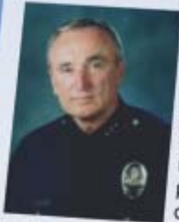
WILLIAM J. BRATTON CHIEF OF POLICE

In response to an increase in gang related crimes in 2006, the Los Angeles Police Department (LAPD) has identified a number of important, wide-ranging initiatives that will be implemented in 2007 and that are designed to significantly reduce the incidence of gang crime. This effort is a comprehensive, multi-faceted approach that navigates the entire criminal justice continuum. Some of the most prominent initiative enforcement features are summarized in this document and are listed below.