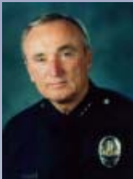
William J. Bratton Chief of Police Los Angeles Police Department