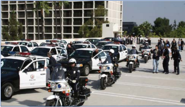
The Sunshine Kids getting ready for the Code 3 run.

Division (CRU Office), Community Relations Section, the Los Angeles Police Protective League and the Los Angeles Police Federal Credit Union. All present were invited to stay and watch an episode of the TV show The Closer , which is filmed at Raleigh Studios. Everyone was then invited for Code 7 with some cast members from The Closer .