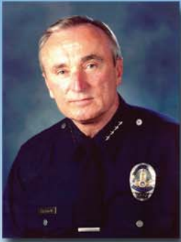
WILLIAM J. BRATTON CHIEF OF POLICE