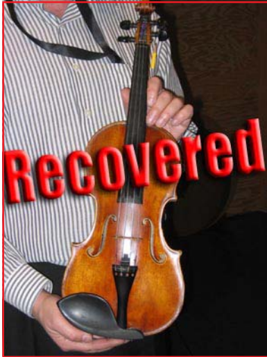
Recovered Carlo Tononi Violin