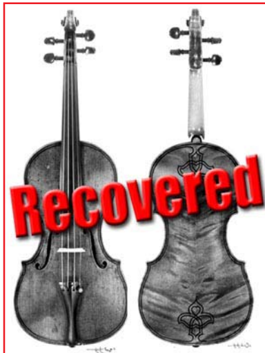
Recovered Jean Baptiste Vuillaume Violin