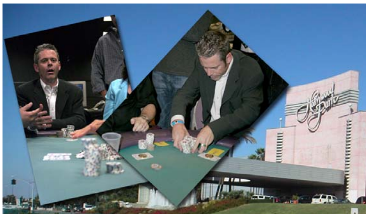
Actor and radio host C. Thomas Howell rakes in the chips at the first ever celebrity Texas Hold 'em Charity Tournament benefiting the Los Angeles Police Memorial Foundation.

The monies raised go toward supporting families of sworn officers killed in the line of duty, and assists sworn and civilian employees who have serious injuries or suffer from catastrophic illness. □