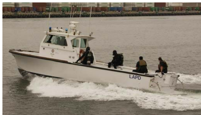
Underwater Dive Unit boat was refurbished by the Los Angeles Police Foundation