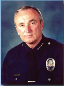
WILLIAM J. BRATTON CHIEF OF POLICE