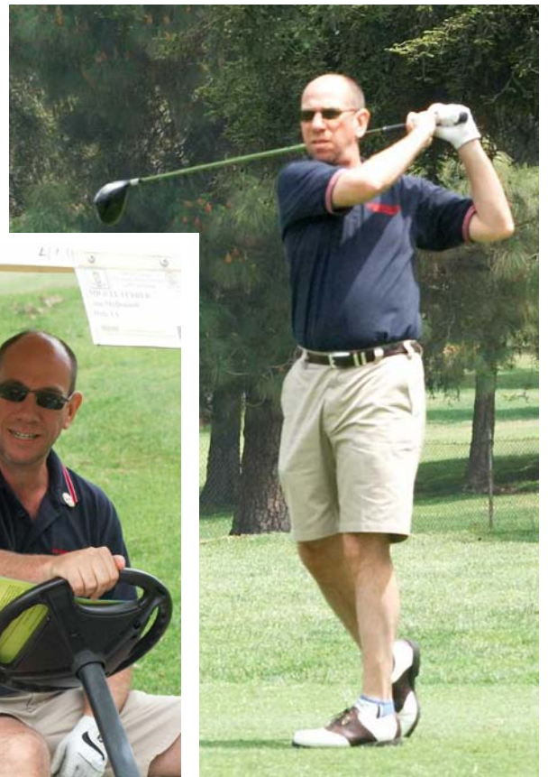
Celebrity Host Miguel Ferrer is a big hit with the fans.