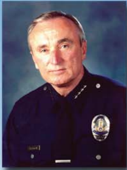
WILLIAM J. BRATTON CHIEF OF POLICE