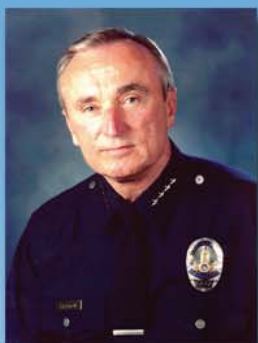
WILLIAM J. BRATTON CHIEF OF POLICE