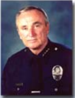
WILLIAM J. BRATTON CHIEF OF POLICE