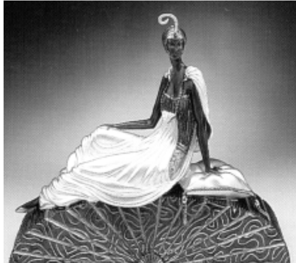
ERTE King's Favorite bronze #72/375 14 3/4" x 16" x 4 3/4" tall