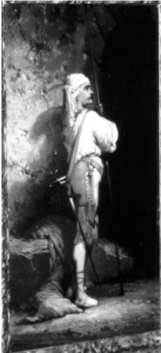
MEISSONIER, Jean Louis Ernest (1815-1891) Cavalier With Spear oil on panel signed lower right 16" x 8"