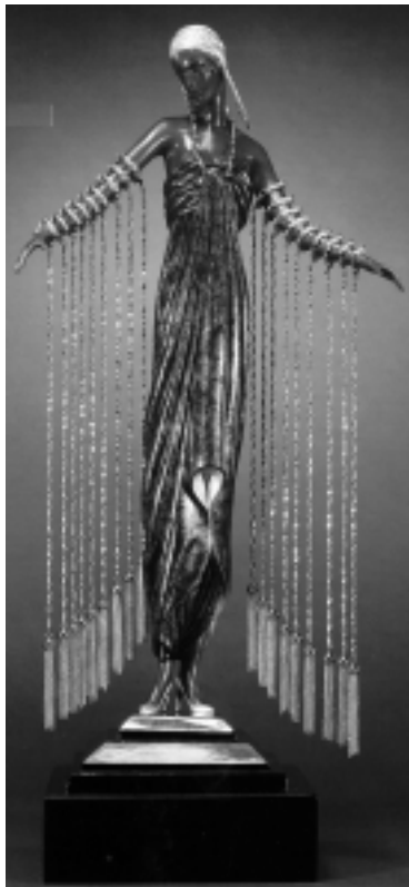
ERTE Zobeide bronze #198/375 21 1/2" tall