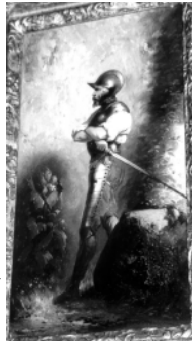
MEISSONIER, Jean Louis Ernest (1815-1891) Cavalier With Sword oil on panel 16" x 8"