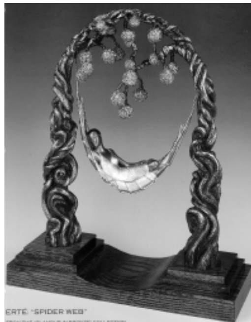
ERTE Spider Web bronze with wood base #181/375 22 1/2" tall